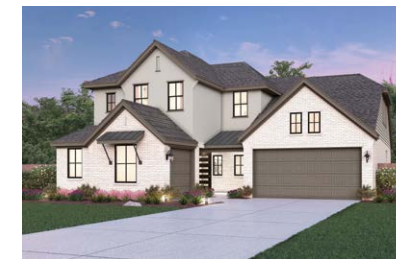
Hamilton Thomas Homes