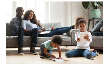
K. Hovnanian Homes