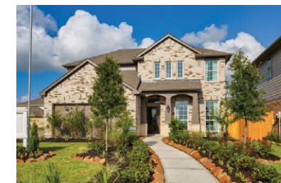
Devon Street Homes