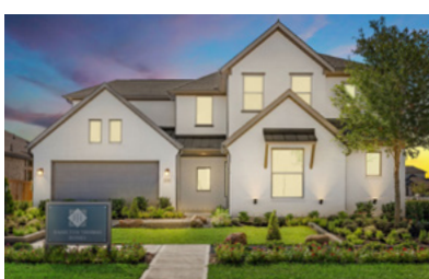
Hamilton Thomas Homes