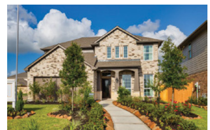
Devon Street Homes