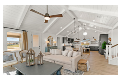
K. Hovnanian Homes