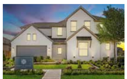
Hamilton Thomas Homes