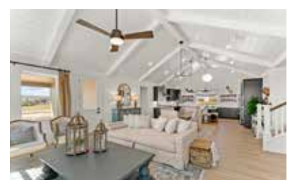
K. Hovnanian Homes