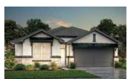
Willow at Marvida Homes for Rent