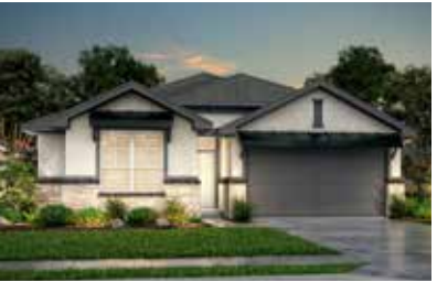
Willow at Marvida Homes for Rent