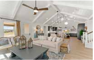
K. Hovnanian Homes