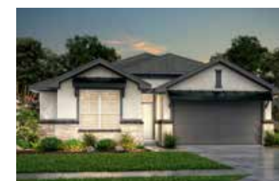
Willow at Marvida Homes for Rent