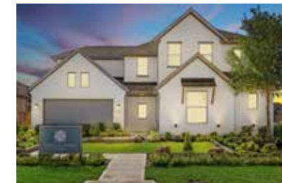
Hamilton Thomas Homes