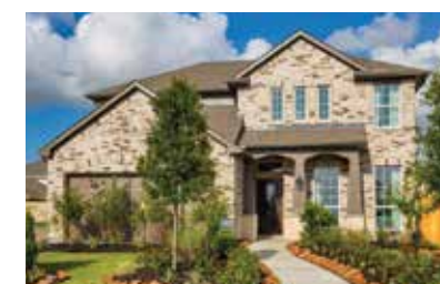
Smith Douglas Homes