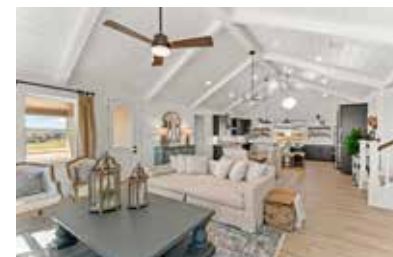
K. Hovnanian Homes