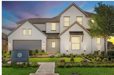
Hamilton Thomas Homes