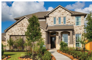
Smith Douglas Homes